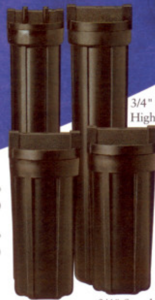
1/2" Slim Line® High Temperature #20